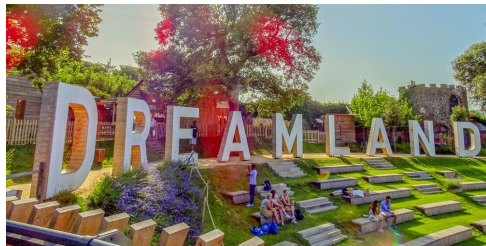
Margate Beach at Sunset and Dreamland amusement park.

The Turner Contemporary is a stunning landmark gallery and is the largest exhibition space in the South East outside of London. The gallery offers sensational views over the North Kent coast, captures the dramatic light effects and offers visitors a unique opportunity to engage with and explore intriguing links between historical and contemporary art through the programme of temporary exhibitions, events and learning opportunities.