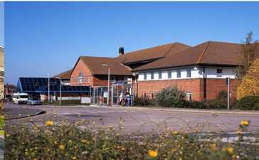
Margate Queen Elizabeth the Queen Mother Hospital