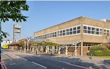
Ashford William Harvey Hospital