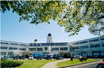
Canterbury Kent and Canterbury Hospital