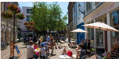
Alfresco Dining in Margate

The Turner Contemporary is a stunning landmark gallery and is the largest exhibition space in the South East outside of London. The gallery offers sensational views over the North Kent coast, captures the dramatic light effects and offers visitors a unique opportunity to engage with and explore intriguing links between historical and contemporary art through the programme of temporary exhibitions, events and learning opportunities.