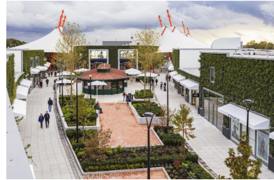
Wye, Kent Downs—conservation area and The Eureka leisure park.

There are traditional pubs, bars in and around the town centre; the Blacksmiths Arms Pub is an F1 favourite, along with the newly opened Brewery Curious Brew