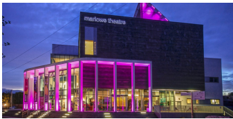
Marlowe Theatre, Canterbury

Canterbury's timeless appeal may be characterised by its awe-inspiring cathedral and status as a World Heritage Site, but the city remains a modern and vibrant cultural center enlivened by smart restaurants, traditional pubs, nightclubs and live music venues. As well all these there is the Marlowe Theatre and the Gulbenkian Theatre and 2 cinemas having a variety of events